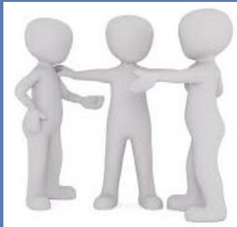
DISCUSS WITH THE VICTIM AND THE STALKER