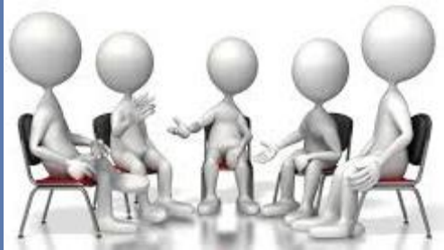
TALK WITH THE PARENTS